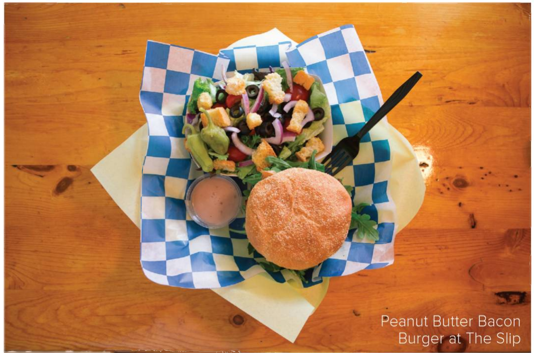
Peanut Butter Bacon Burger at The Slip