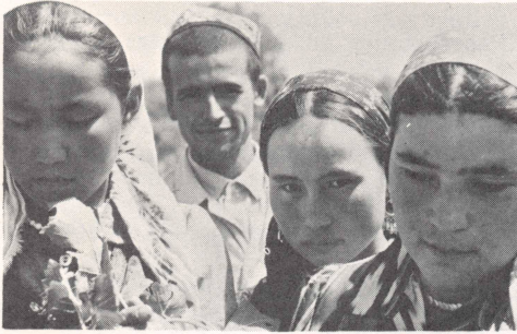
SIBERIAN WORKERS: These people exemplify the various races that make up the vast empire of Russia that extends from the Volga to the Sea of Japan. Raphael Green draws on his rich experiences in Siberia, Outer Mongolia, and Manchuria, in presenting his "Russia vs. China" film lecture, to shed light on this open struggle for power, with its significant world-wide implications.

"Russia versus China" will be the topic of a contemporary affairs lecture at Northwest College by Mr. Raphael Green in the new learning center auditorium at 8:00 p.m., December 5. Mr. Green, an authority on Asian affairs will personally present his color film documentary bearing the title of his lecture, depicting the conflict between the Russian bear and the Chinese dragon.