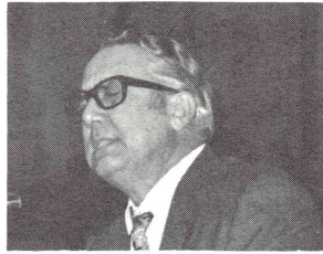
"A time for praying. . ."