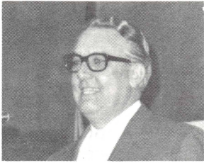
"A time for smiling. . ."