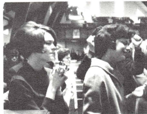
"And a time for responding. . ."

Over 350 students and the College Dining Hall for national Missionary Food was sponsored, by the student Group, as a means of cause to which the college strong support over the decorated hall, portraying were display booths from where served samples of tional food favorites around delicacies from India, Eur and the Orient.