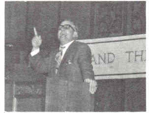
"A time for preaching. . ."

Over 350 students and the College Dining Hall for national Missionary Food was sponsored, by the student Group, as a means of cause to which the college strong support over the decorated hall, portraying were display booths from where served samples of tional food favorites around delicacies from India, Eur and the Orient.