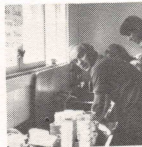
Provisions for body.