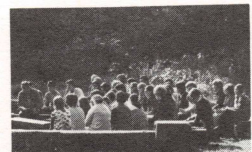
Provisions for soul.