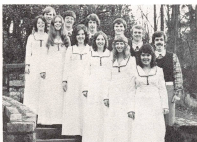
The Maranatha Sounds