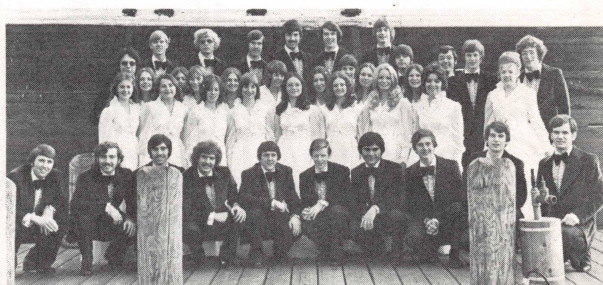
The King's Choralons