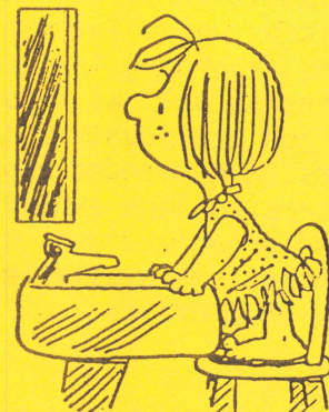
The only real way to look younger is not to be born so soon.