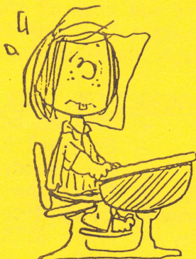
When it's hot in the classroom, and you fall asleep at your desk, your math paper sticks to your head.

The college not only encourages but expects students to attend church regularly. Current reports indicate the number of resident hall students not attending church has increased. A survey will be taken on Sunday mornings to determine any major causes of this laxity in church attendance. The college will do everything possible to assist students in this all-important part of Christian Service and commitment.