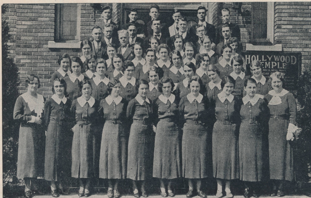
PIONEER STUDENTS OF 1934