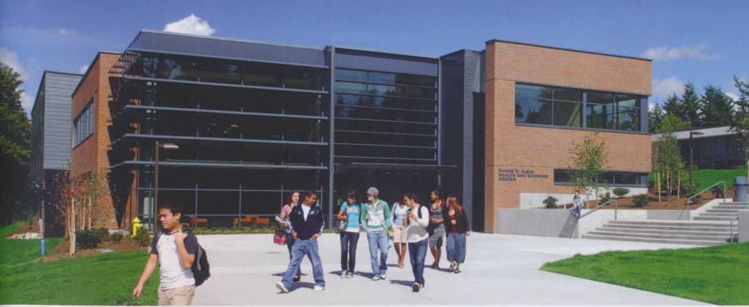
The Health and Sciences Center has become an integral part of academic life at Northwest University.