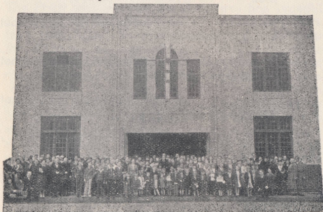
Cottage Grove Sunday School, 1939.