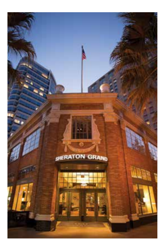
The NU Sacramento Launch Event was held at the Sheraton Grand Hotel in downtown Sacramento.