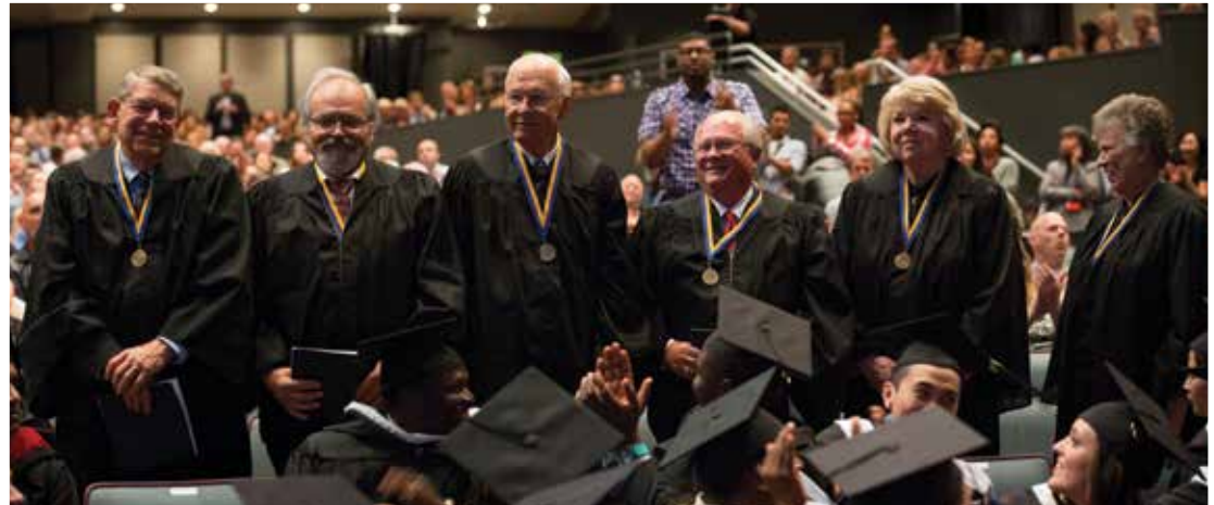
Alumni from the class of 1963 are honored during the ceremony. They also took part in a reception and campus tour following Commencement.