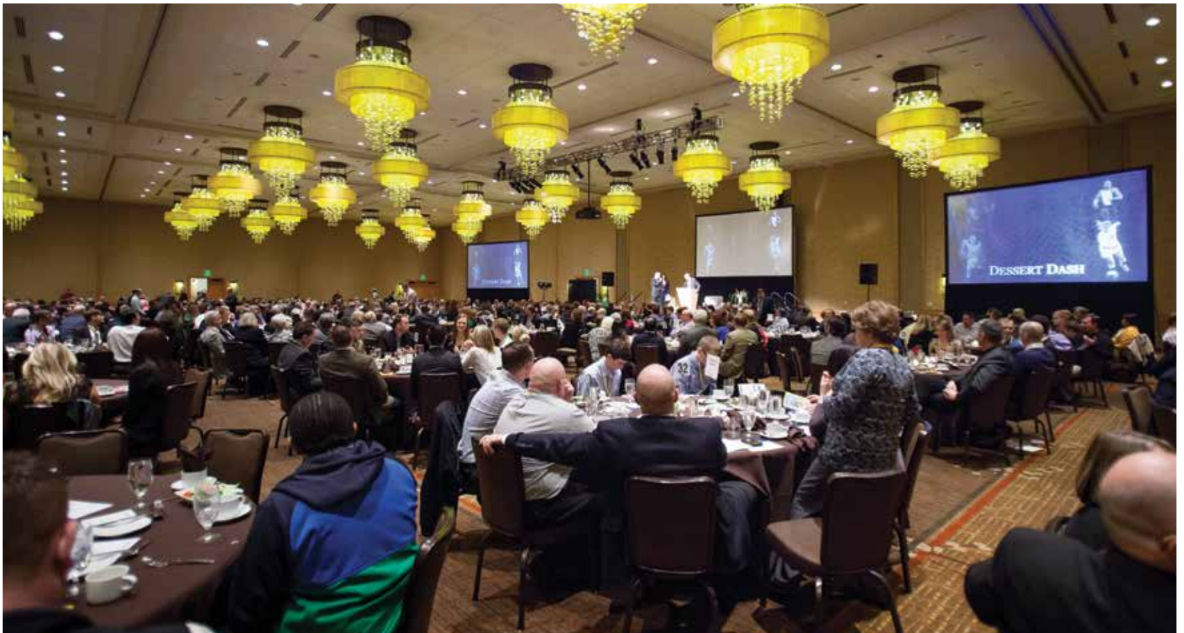
Over 600 guests dining, bidding, and having a great time at the Hyatt Regency Hotel in Bellevue, Washington.