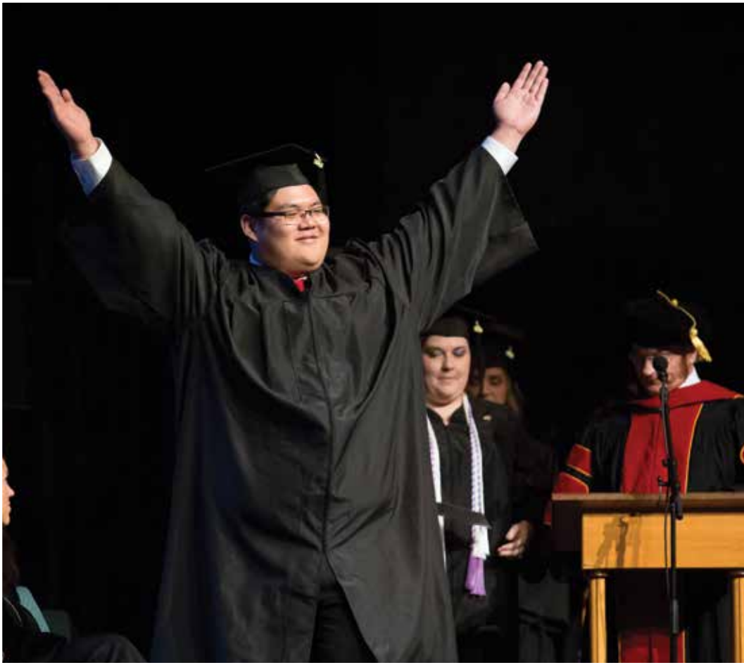
An undergraduate student celebrates as he makes his way to receive his diploma.