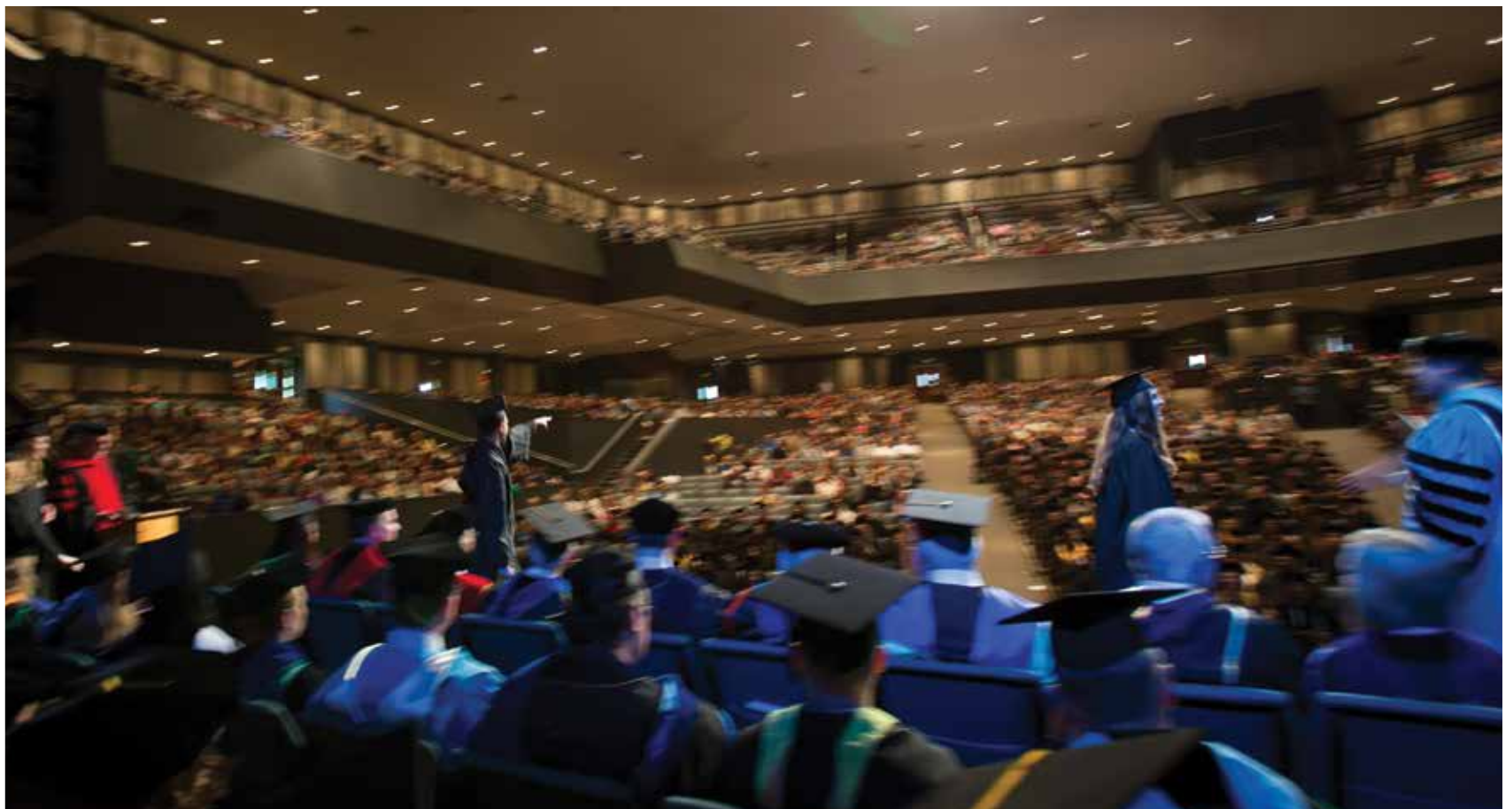
Over 390 students walked across the stage to receive their undergraduate, graduate, and doctoral diplomas.

“Hopefully it’s more often than not, you will know that God has used you to demonstrate his glory to others. There is no feeling like that, absolutely no feeling, when you know that God has said to you, ‘This, this, is why you’re here.’”