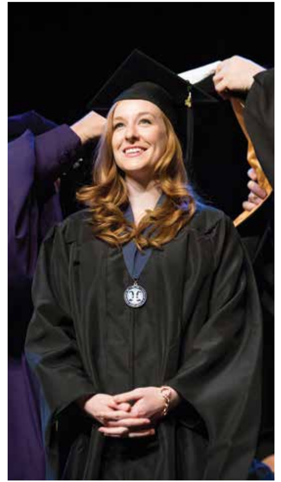
A graduate student receives her ceremonial hood.