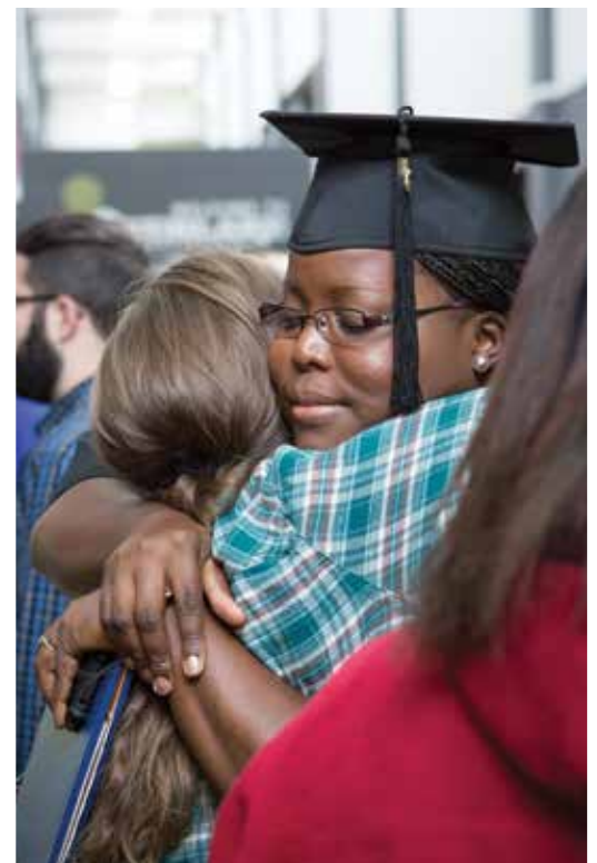
Graduates celebrate with their family and friends.