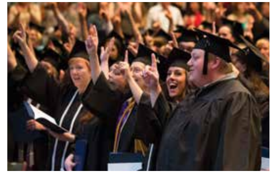
Singing of the Alma Mater .