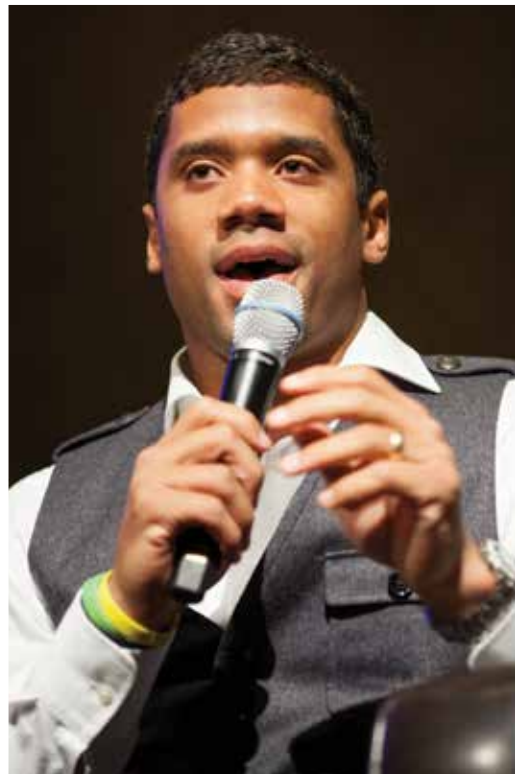
Russell Wilson, guest of honor and quarterback for the Seattle Seahawks.