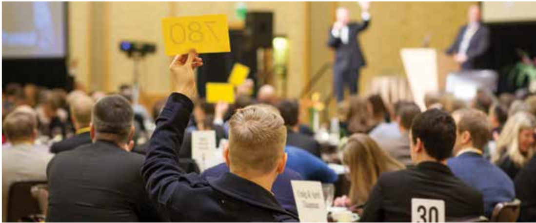
Another paddle raised to benefit our student athletes.