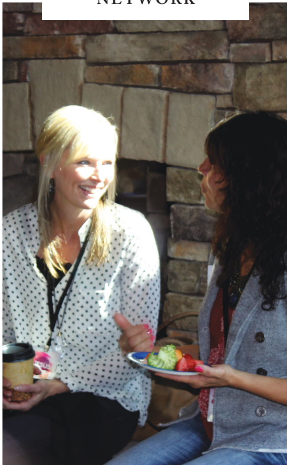
NW MINISTRY NETWORK