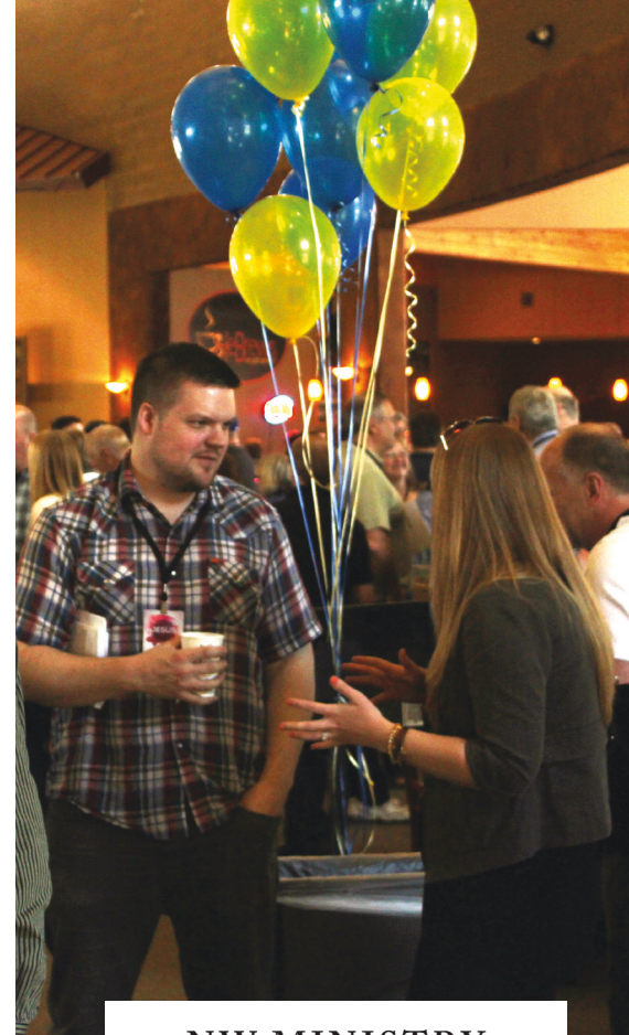
NW MINISTRY NETWORK