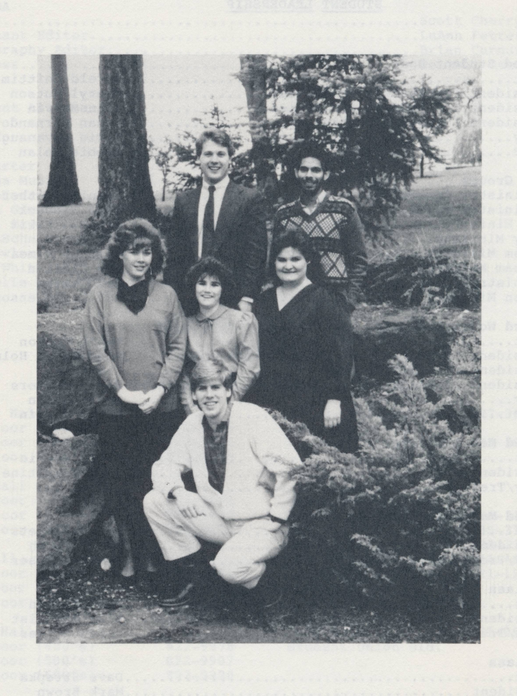
A.S.B. EXECUTIVE OFFICERS