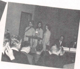
a moment of musical interpretation