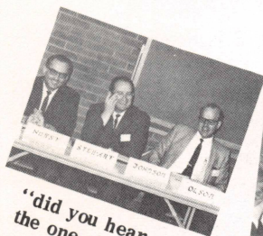
"did you hear the one about . . ."