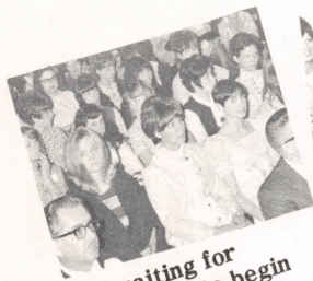
waiting for chapel to begin