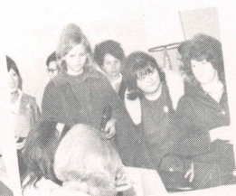
meeting new friends during registration