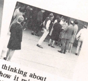
thinking about how it might be . . . as a student next year.

— over 800 guests visited NC on Campus Day. Better than two-thirds of this number were first-timers on the campus. About one-half of the high school age youth were seniors who will graduate in June.