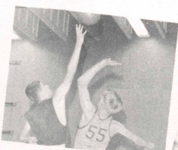
visitors vs. the Eagles