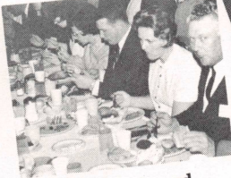
plenty of good food and fellowship