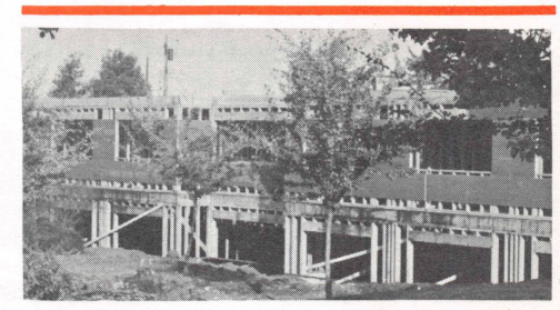
Building progress continues on new men's residence hall. Completion of hall is slated for January, 1970.