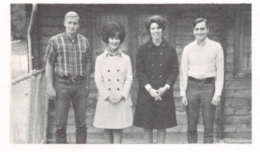
New ASB officers lead student retreat.

Students Come From 23 States and 5 Foreign