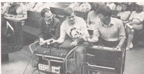
Finnish public address equipment technicians provided excellent sound system for all indoor and outdoor concerts.