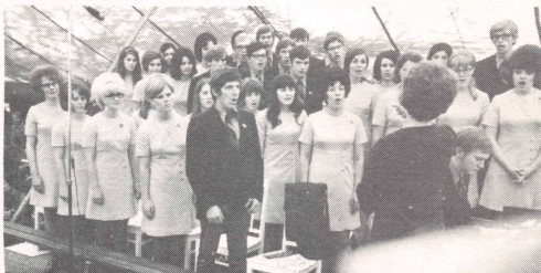
Choir in concert at Pentecostal Conference in Hameenlinna, Finland.