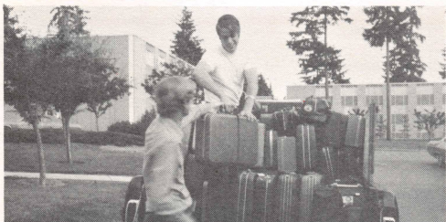
Lots of muscle needed for over 75 pieces of checked luggage—plus all carry-on items!