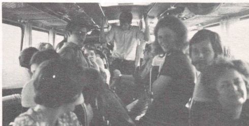
The bus became "home away from home" for tour members in Finland.