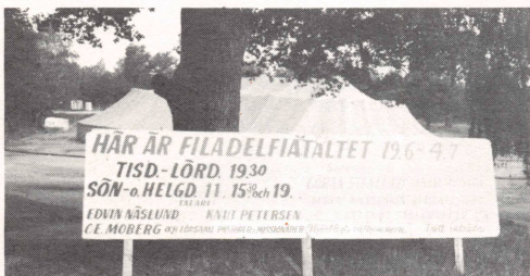
The King's Choralons presented a concert at the city-wide tent crusade sponsored by Philadelphia Church in Stockholm, Sweden.