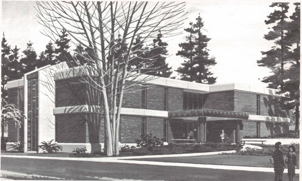
Proposed New Library will become Educational Center of Northwest College Campus.

The campus is beautiful, the facilities are excellent, the faculty is the best, and the students are simply great! Let's all join together in one more effort to make Northwest College all it can be!