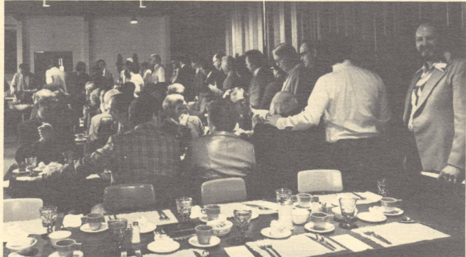
Each fall the ministers from the Seattle section meet on campus for their fellowship time.