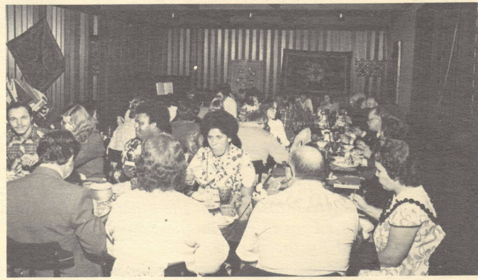
The annual Foreign Students dinner.