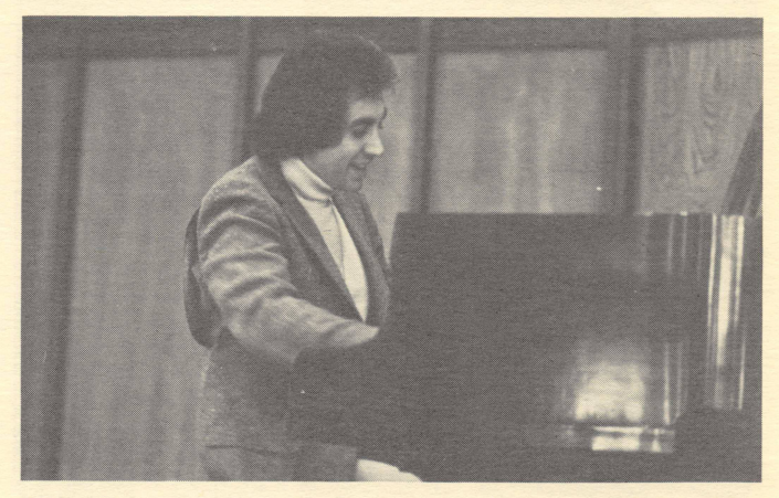
"Dino" ministering on the keyboard.