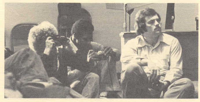
All Chapel guests' will be shot!

Field reports indicate that up to 1,000 souls were touched in various ways, mostly by personal salvation. Many were said to have been filled with the Holy Spirit. Rev. Cili, who is an ordained minister with the Fijian Church, said the work measured up to the "highest level of ministry" ever experienced by the people.