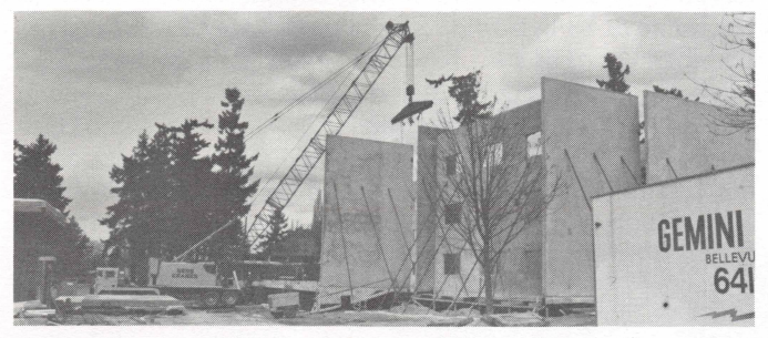
And another goes into place.