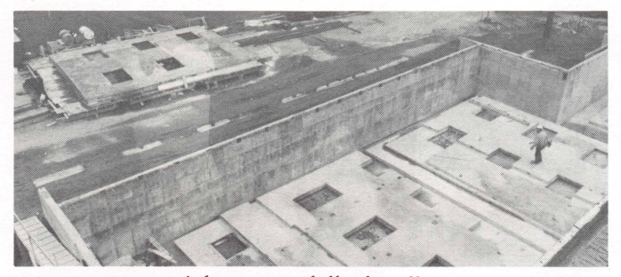
A basement full of walls.

The new residence hall seemed to be progressing so slowly. Nothing was rising from the foundation. It's a precast concrete tilt up wall construction. Then in three days all walls went up. How interesting to watch a 78,000 lb. wall "flying" into place! The contractor says, "We're on schedule for September 1!"