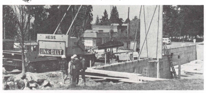
One is up.