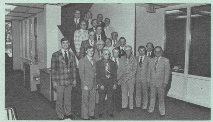
The members of the Board who were present during the semi-annual Board meeting. Many of our Board members are alumni of the school and are making a significant contribution to the on-going work of the College.