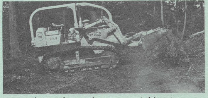
Clearing the way for more married housing.