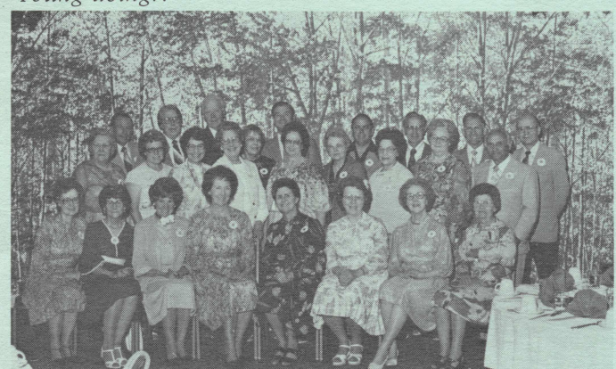
The 1939 Class Reunion