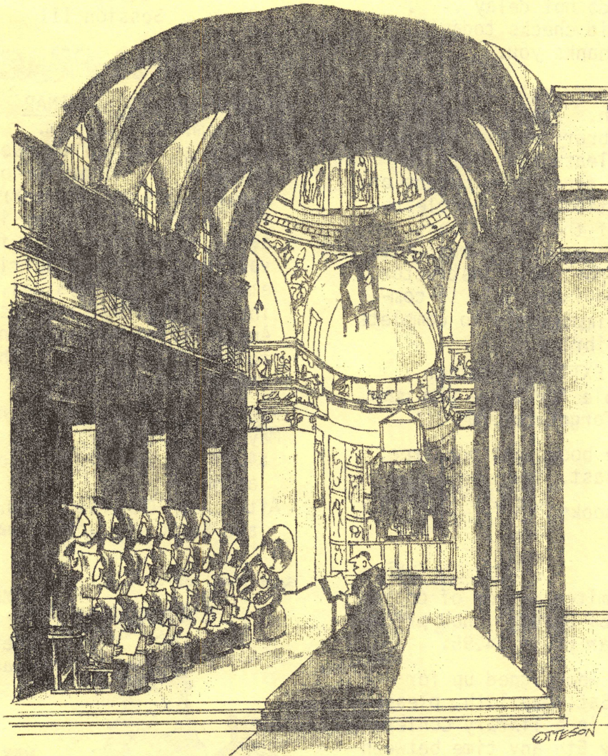
"The traditional Gregorian chant is usually performed without accompaniment, Brother Fespucci."

Music Books - "2nd Chapter of Acts" "100 Songs I love to Sing" If found, contact Kerri Dickensen - P615.