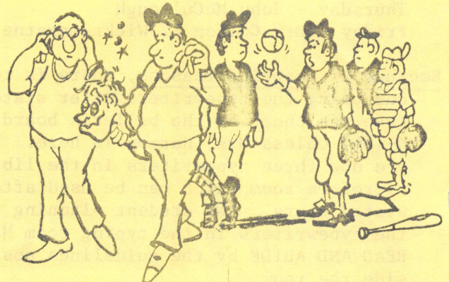
Which brings us to the rather obvious question. Why do they call this a softball?

P.R. Department here at Northwest needs an artist to design posters, magazine ads, etc Requirements: brains, talent, imagination.