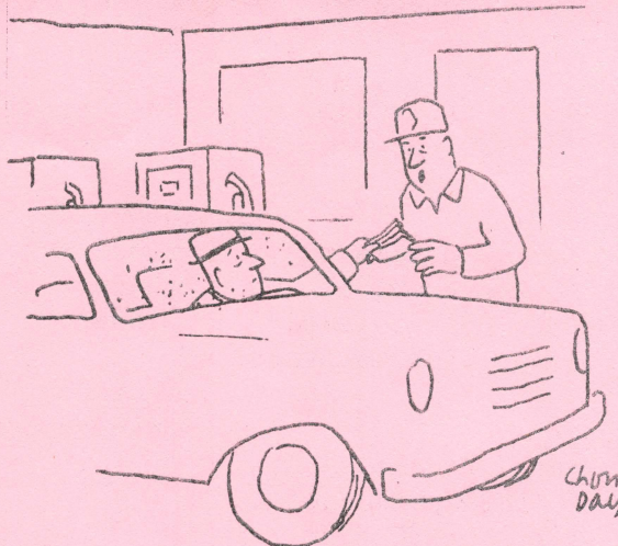
"Ya oughta wash that windshield, Mac. It's filthy."