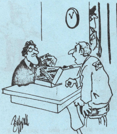
"You mean that's the 'clever legal maneuver' you're gonna spring on 'em?! ... A 'get out of jail free' card?! ..."

ANY STUDENTS WHO SIGNED UP FOR RADIO WORKSHOP 299 MUST BE AT THE KCNC ORGANIZATIONAL MEETING. Monday, January 12 in the SUB.