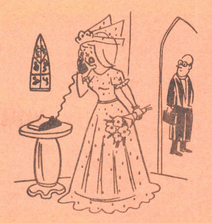
"What do you mean he's out jogging?"