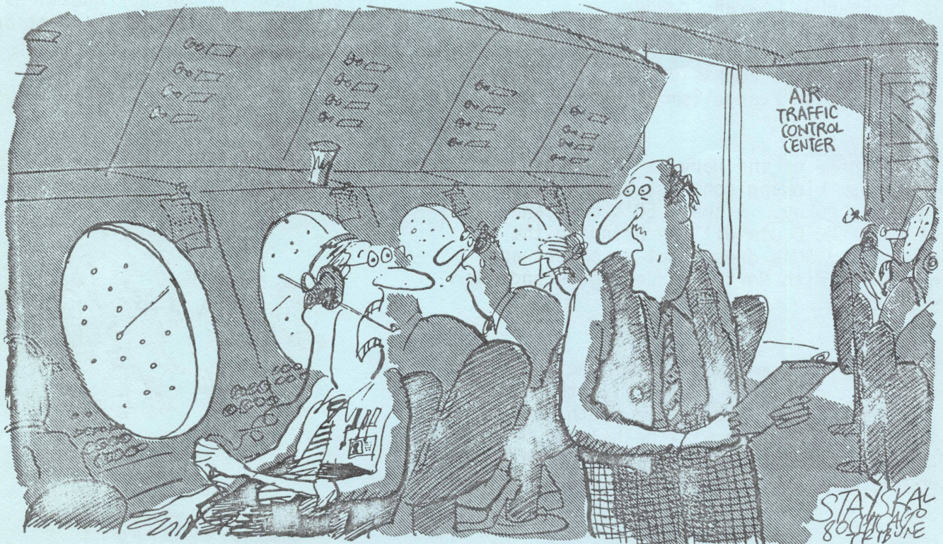
"WHEW... FLIGHTS 109 AND 211 ALMOST BECAME 320!"

Need a church home? Westminster Assembly in Northern Seattle would like to serve you. A van will be here Sunday mornings around 9:00 in front of Perks Hall to take you to our church.