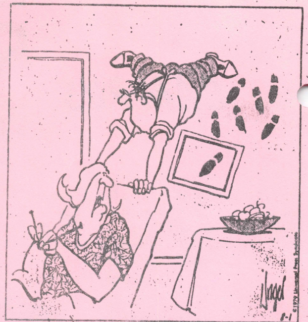
"I hope you're not walking across my clean floor."