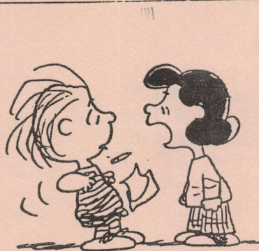
The pen may be mightier than the sword, but not a sister's mouth.