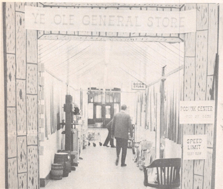
The hall on the main floor of North Central Bible College became the "general store" during Pastors Week.