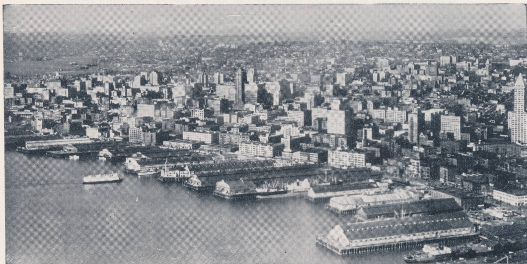
View of Seattle's Harbor and Downtown area