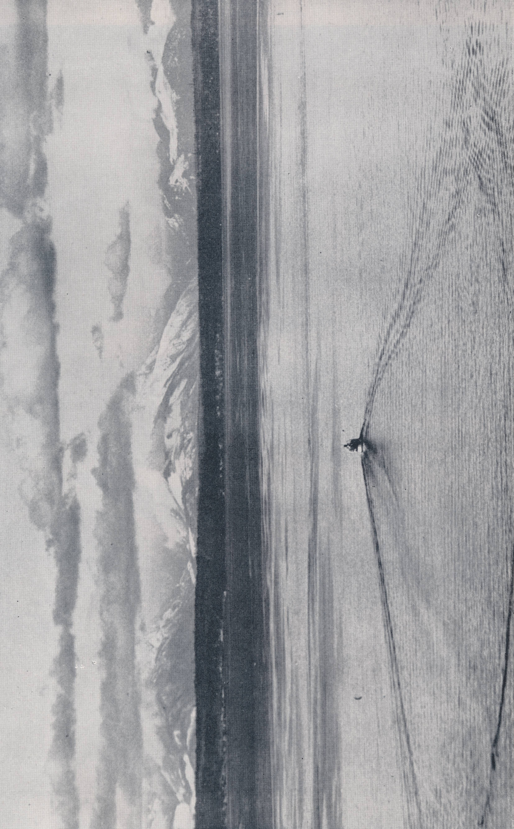
Looking across Puget Sound towards the Olympics