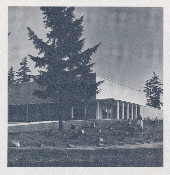
Scene on the campus of NORTHWEST COLLEGE.

Founded in 1934, NORTHWEST COLLEGE was the answer to a need long felt throughout the Northwest District of the Assemblies of God for a Bible training institute. From 18 students who enrolled on the first day on October 1, 1934, the aggragate students during the past several decades of the school's history has grown to several thousand students. Of this number, over 200 have gone forth as missionairies; several hundreds have been trained for pastoral and evangelistic ministries; and several hundreds more have been trained as effective lay-workers in local churches.