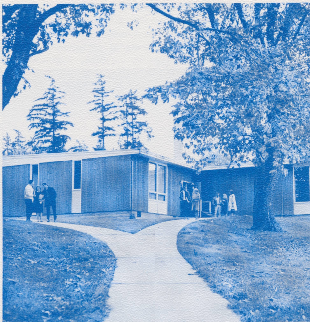
Scene on the campus of NORTHWEST COLLEGE.

Founded in 1934, NORTHWEST COLLEGE was the answer to a need long felt throughout the Northwest District of the Assemblies of God for a Bible training institute. From 18 students who enrolled on the first day on October 1, 1934, the aggregate students during the past several decades of the school's history has grown to several thousand students. Of this number, over 200 have gone forth as missionaries; several hundreds have been trained for pastoral and evangelistic ministries; and several hundreds more have been trained as effective lay-workers in local churches.