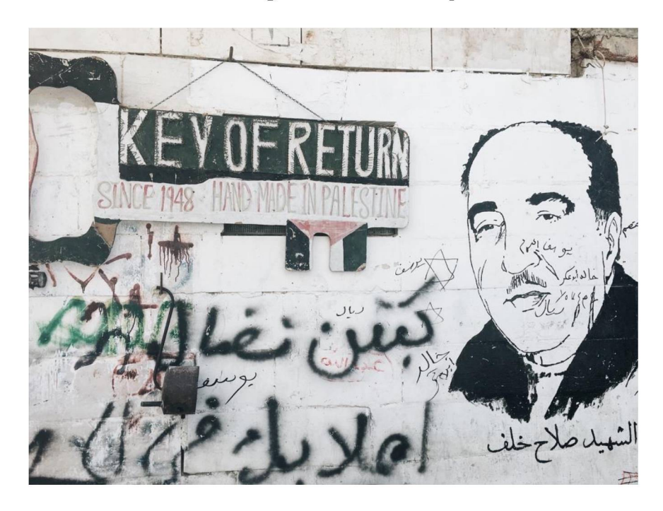
Session 1: Introduction to Peacemaking and the History of the Conflict

"... let them seek peace and pursue it" 1 Peter 3:11 "Blessed are the peacemakers ..." Matthew 5:9