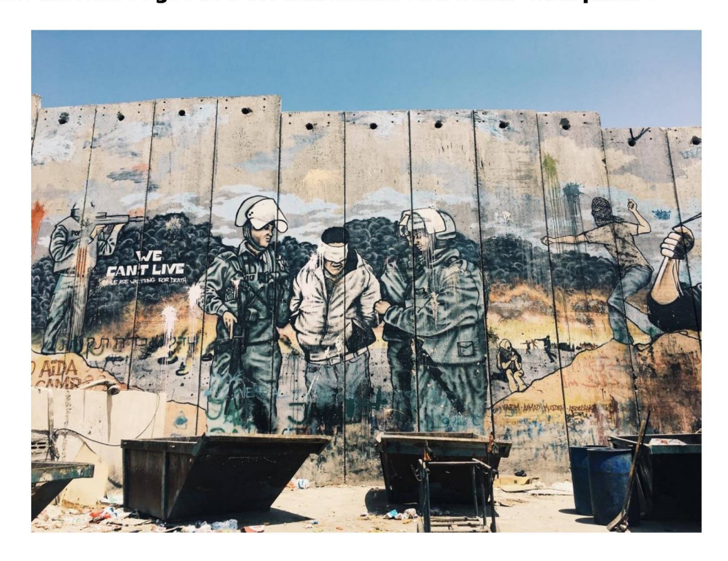
Session 2: The Current Plight of the Palestinian: Life Under Occupation

"When you can rejoice in the narrative of David slaying the giant, yet can't see the rock in the hands of the oppressed in a similar way, it is because of your blindness and not the failure of the oppressed."— Ben McBride