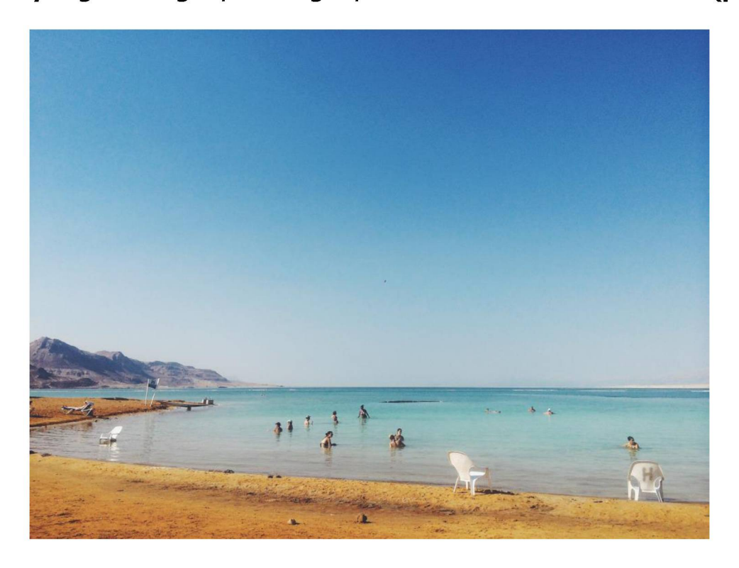
Session 4: Analyzing Theologies, Ideologies, and Beliefs that Hinder Peace (pt 2)

"We choose a different path – nonviolence. We refuse to be enemies. It's not passive, but an action." – Daude Nassar