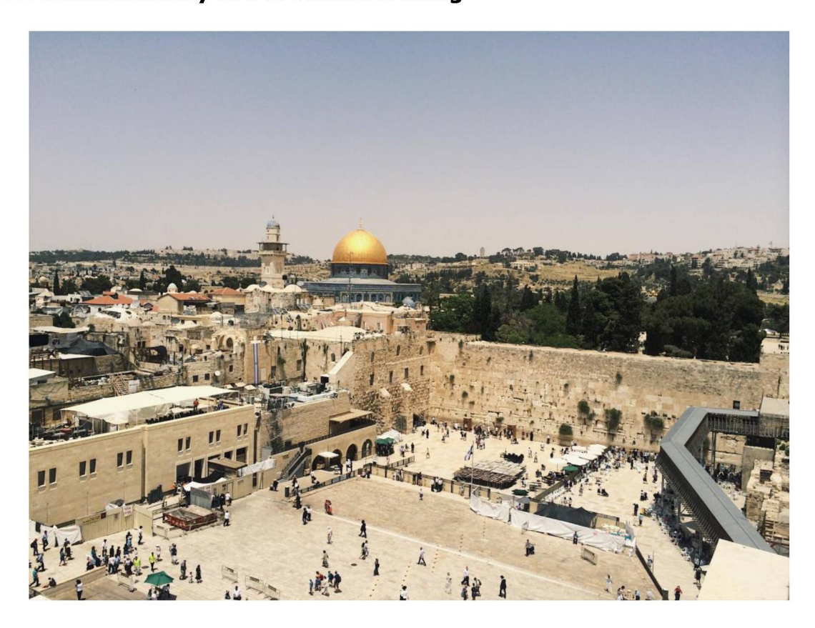
"Peace I leave with you; my peace I give to you ..." - John 14:27