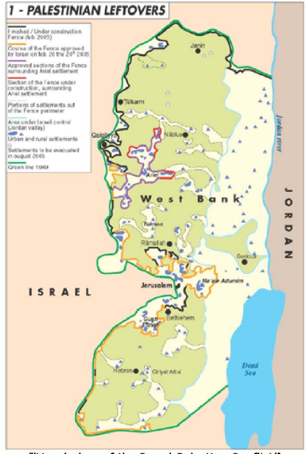
("Vocabulary of the Israel-Palestine Conflict")

While the land on the right side of the green line is the Palestinian territory of the West Bank, in reality, the next map provides a more accurate picture of how much land Palestinians actually have. The 1995 Oslo II Accords separated the West Bank into three different areas that are represented in different colors. Area A is fully under the Palestinian Authority, while Area B is partially under Palestinian control and still under Israeli military jurisdiction. 61% of the West Bank is Area C, which is under full Israeli control of security and civil affairs. This involves planning, laying infrastructure, and development ("Planning Policy in the West Bank"). Area C is not only where illegal Israeli settlements and designated military zones are located, but also where much of the most fertile land throughout the West Bank can be found as well. Palestinian villages that fall in Area C cannot build any type of infrastructure without Israel's approval, and if they do, it will be subject to demolition orders by the state (Ehrenreich 69).