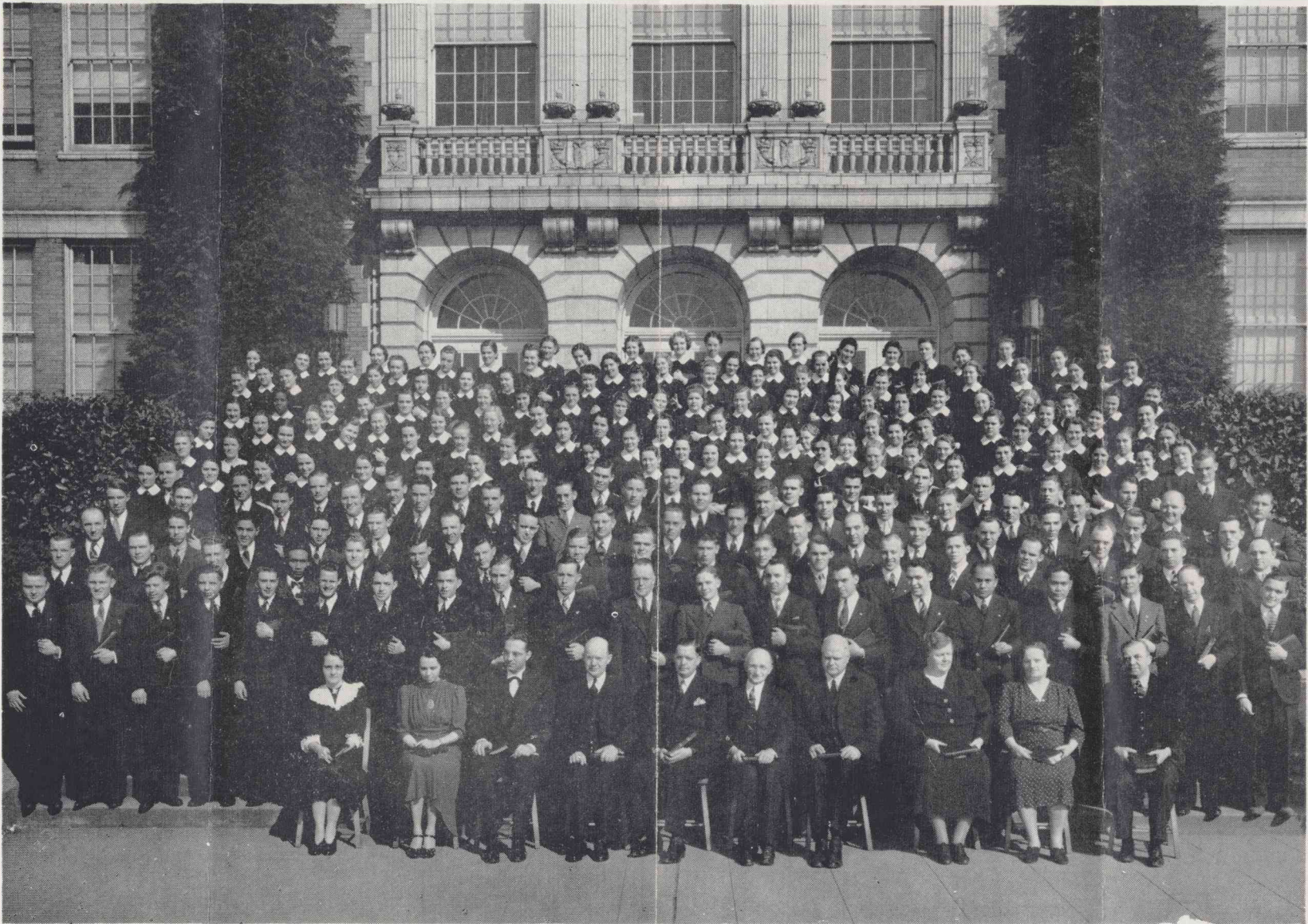
Northwest Bible Institute Student Body and Faculty . . 1940, 1941